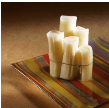
▲ Leeks from Sahagún