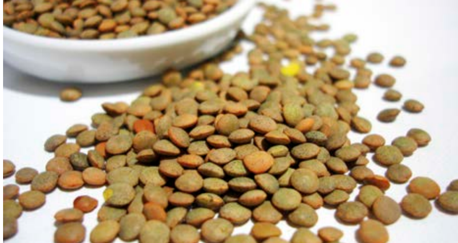
▲ Pardina Lentil