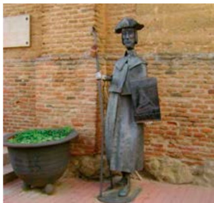
Church of La Trinidad, currently a hostel and Carmelo Gómez Concert Hall.