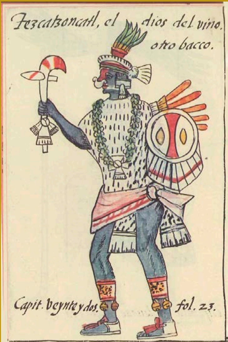
Tezcatzóncatl, dios azteca del vino o pulque al cual se le culpaba de los pecados cometidos por los borrachos. Códice Florentino obra de Fray Bernardino de Sahagún .UNESCO Memoria del Mundo 2015.