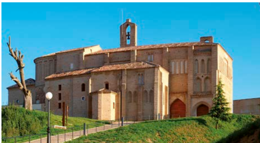
▲ Sanctuary of La Virgen Peregrina. 13 th century. Declared Heritage of Cultural Interest on 3 rd of June 1931.

example of the 13 th -century Mudejar architecture. The ornamental diversity of its apses, which shows a knowledgeable handling of the brick, as well as its pyramid-shaped tower, which looks extremely