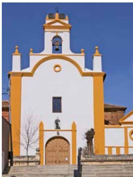
▲ Church of San Juan, 17 th century