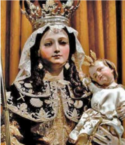
▲ Virgen Peregrina, a work by 'La Roldana', 17 th century