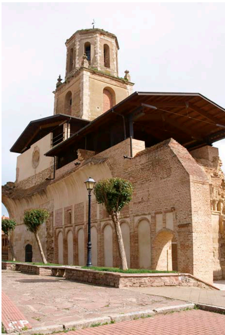
▲ The ruins of Saint Facundus and Saint Primitivus Monastery. Declared Heritage of Cultural Interest on 3 rd of June 1931.