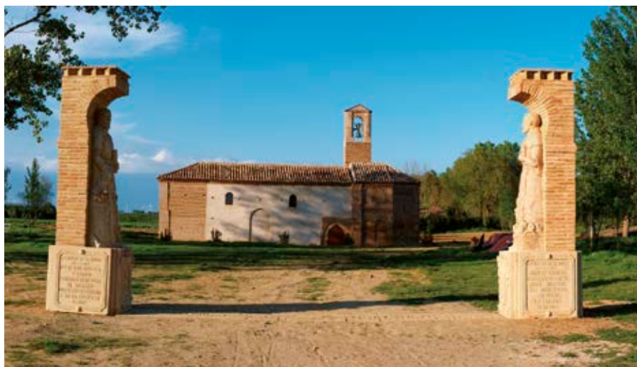
▲ Sanctuary of Virgen del Puente, 13 th century

where stone has been used as a substitute for brick, probably to reinforce the construction. As well as the architecture, other pieces of furniture, like the 13th-century Gothic tomb brought from Sahagún Monastery, can also be found inside.