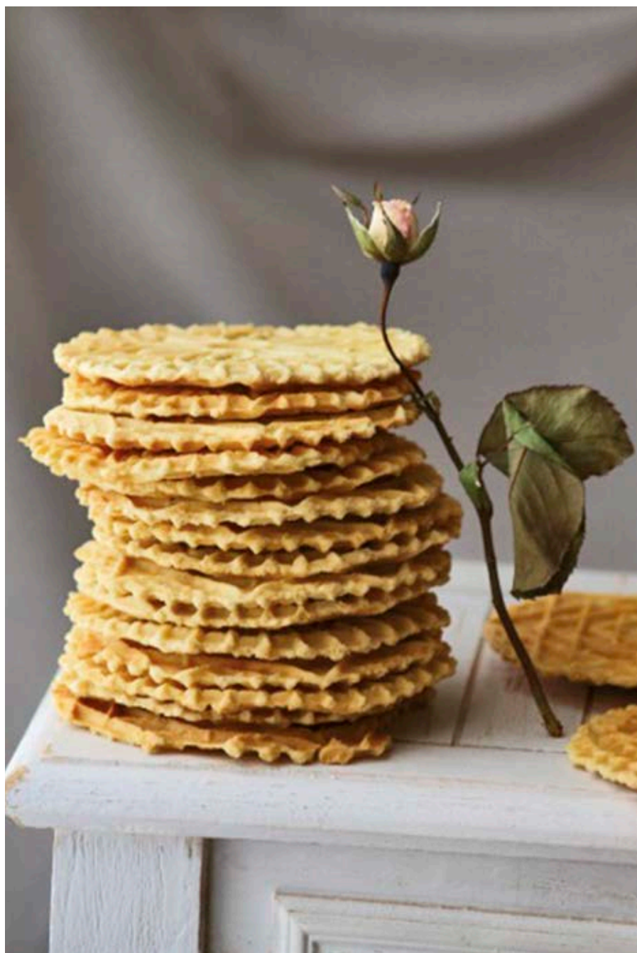
▲ Spanish Waffles lemon cookie