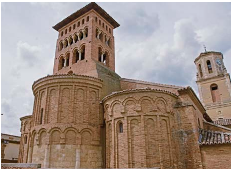
▲ Church of San Tirso 12 th century Declared Heritage of Cultural Interest on 3 rd of June 1931

light in spite of its great dimensions, are worth pointing out here. Attached to the western wall you will find the Chapel of Jesús, built in the 17 th century. The chapel currently houses the 'pasos