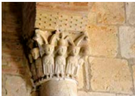
▲ Capital in San Pedro de las Dueñas

Before leaving Sahagún, cross one of its landmarks: the bridge of Puente Canto. This old crossing of the Roman roads and previously of the Vaccaeí paths, is located over the waters of the River Cea, whose course continues up to San Pedro de las Dueñas, 5 kilometres from Sahagún. Its Benedictine Monastery combining stone and brick is a good example of the Romanic Mudejar style. Inside, the magnificent set of stone capitals and the Christ by Gregorio Fernández stand out.